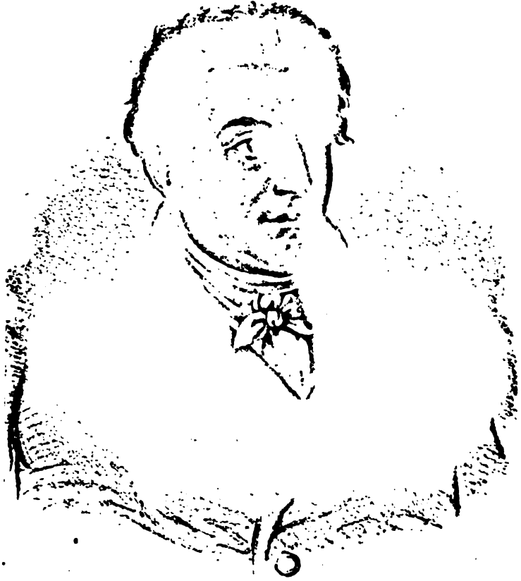
JOHANN GOTTLIEB FICHTE

AT THE TIME OF THE DELIVERY OF THESE ADDRESSES